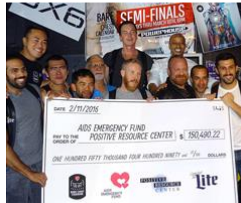
The 2016 Bare Chest Calendar Men

If you or someone you know would like to be a part of this once in a lifetime fundraising experience, click here to find out more about the recruitment process .