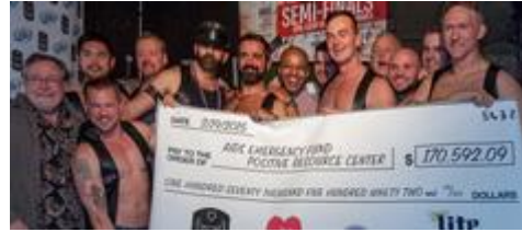
2015 Bare Chest Calendar Men Check Presentation at The Powerhouse

Congratulations and a huge thank you to Team 2015, from the calendar men and the Bare Chest Calendar committee behind the scenes to all the volunteers that helped out at the events, on a new fund raising record, $170,592! These fine folks worked tirelessly throughout the year to make this incredible goal happen for PRC and AEF.