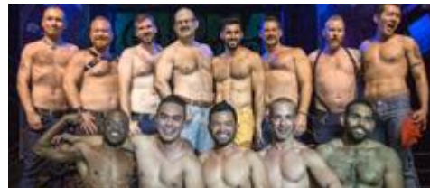
2016 Bare Chest Calendar Men

To help our boys further their cause, you can order your 2016 Bare Chest Calendar online here.